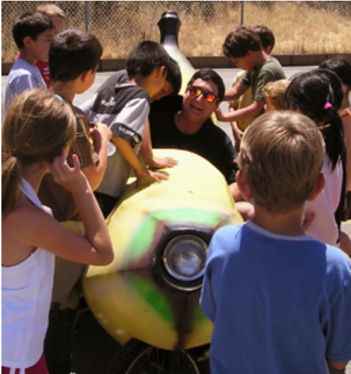
School kids surround the Banana Bike by Terry Axelson