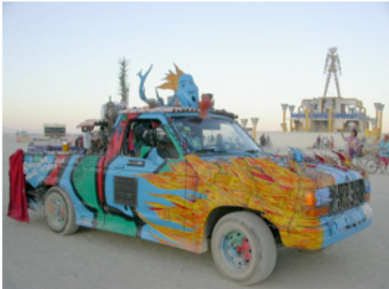
Truck in Flux by Philo Northrup

Get a sneak preview by watching the National Geographic Channel's show celebrating ArtCar Fest (viewable at www.artcarfest.com/movies.html )