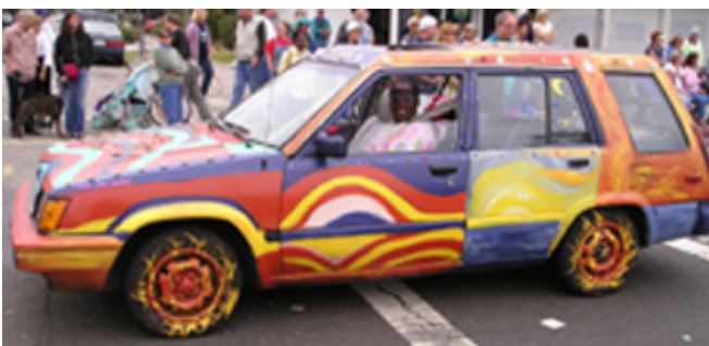
Little Suzy by Dez Flowers