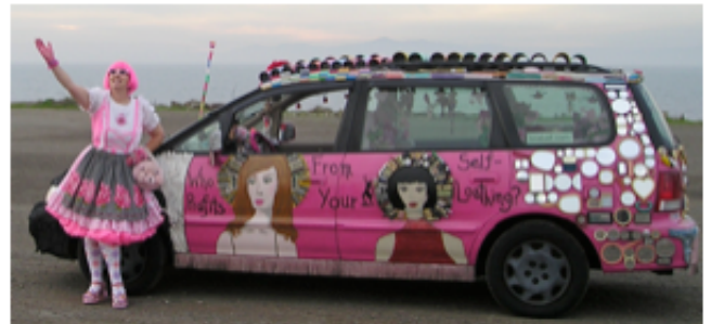
The Vain Van by Emily Duffy

ArtCar artists follow their individual notions about how to create or customize their vehicle. They come from many backgrounds and almost half of our artists are women. Some are self-taught folk artists, while others have formal art training, or custom car backgrounds. What brings them together is their creative impulse for self-expression.