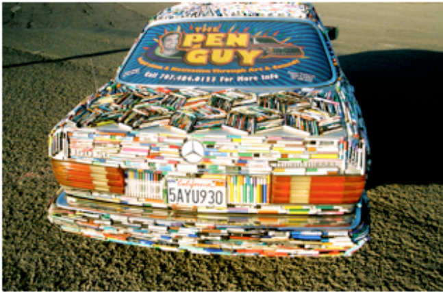
Mercedes-Benz by Costas Schuler